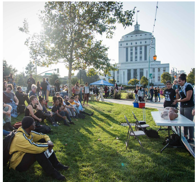
Earthquake preparedness and first aid instruction at the Stop Urban Shield 2017 Community Preparedness Fair.