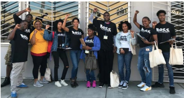
Black Organizing Project.