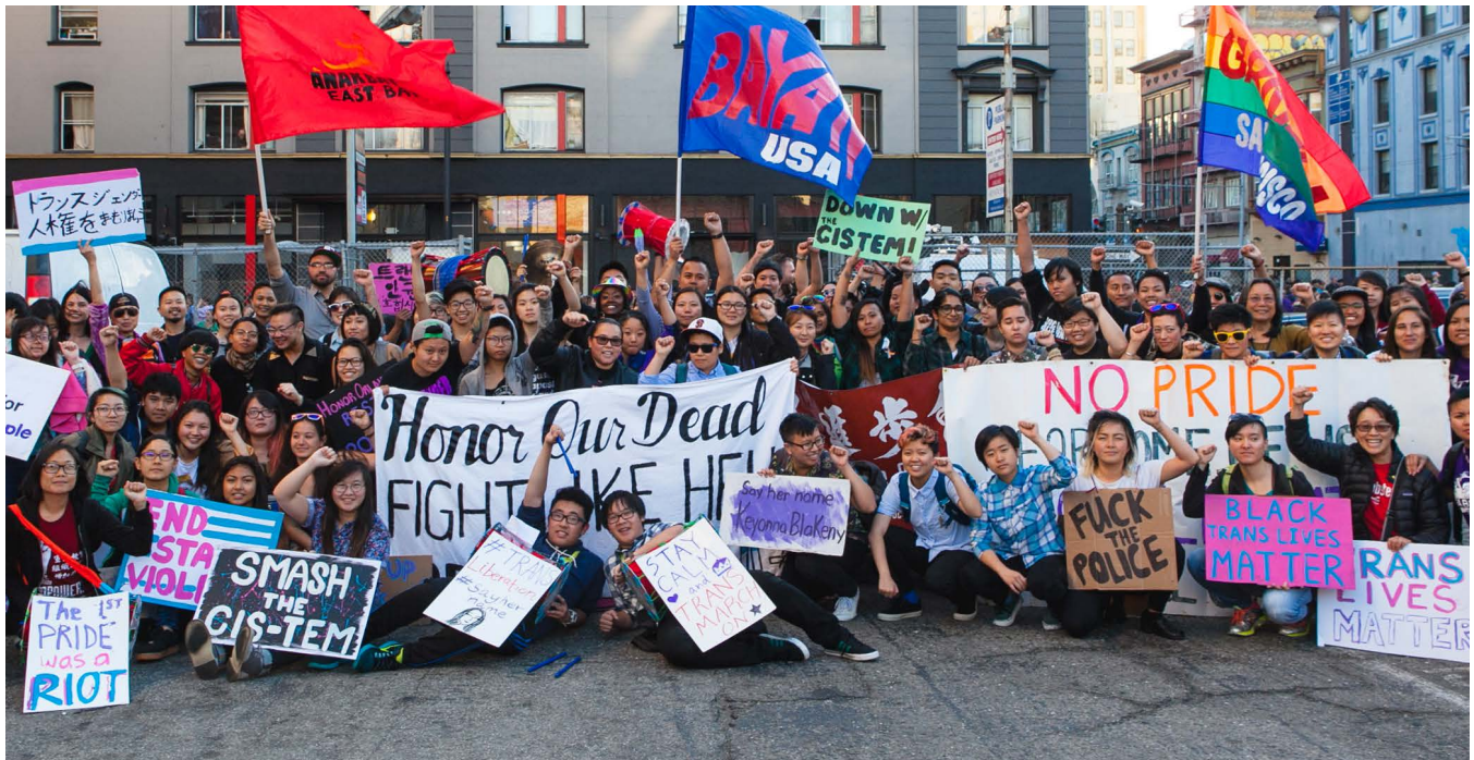
API Equality at the Trans March.