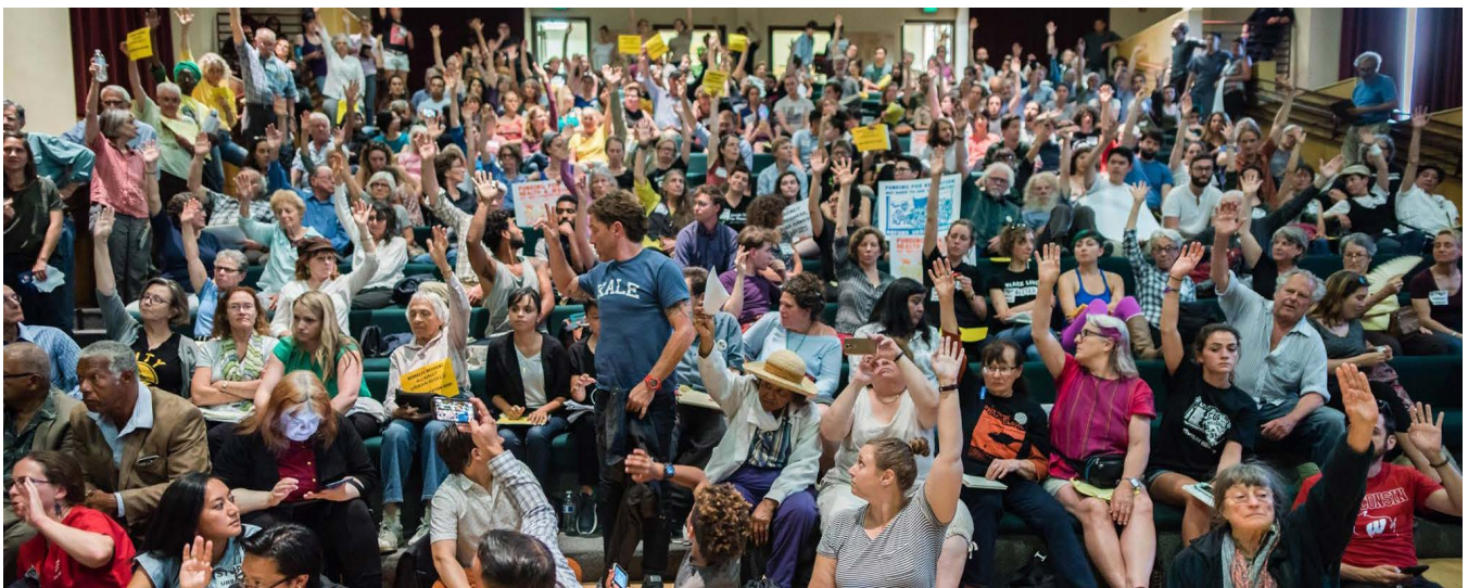
Berkeley residents protesting Urban Shield at a City Council meeting.

This report closes with recommendations for potential emergency preparedness projects that centralize people first and the life affirming skills, resources and practices communities need to be confident and prepared. Given the harms and risks associated with law enforcement, explored in the first half of the survey, the Oakland Power Projects recommendations seek to reduce involvement of law enforcement in emergency preparedness and to uplift alternative measures and investments.